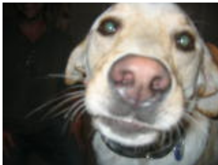
Figure 1. shane.jpg

This executes a single convert command, hiding from the user features such as remote multisite execution and fault tolerance that will be discussed in a later section.