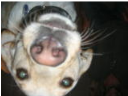
Figure 2. rotated.jpg